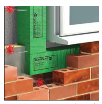
Masonry Cavity Stop Sock MP552 positioned in a vertical and horizontal orientation around a window opening.

Consideration must be given towards the overall width of the party wall construction – please contact Mayplas for further technical guidance.